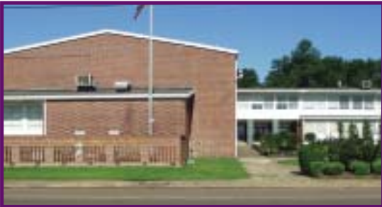
Lee Middle 1815 Military Road Columbus, MS 39701