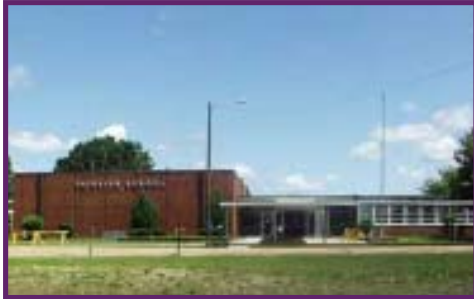
Fairview Elementary 225 Airline Road Columbus, MS 39702

The Aerospace & Science Magnet School at Fairview Elementary offers a high quality academic program infused with Math and Science education. A research-based Science Exploration Lab will offer students an opportunity for in-depth studies of physical science, earth science, and life science. Research shows math and science education are critical components to prepare students to compete in a global workforce.