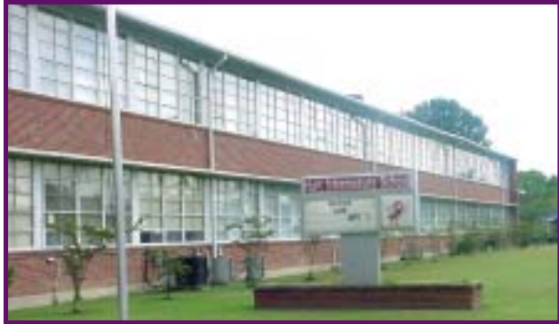
Hunt Intermediate 924 20th Street North Columbus, MS 39701