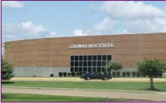
Columbus High 215 Hemlock Street Columbus, MS 39702