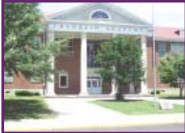
Franklin Elementary 501 North 3rd Avenue Columbus, MS 39701