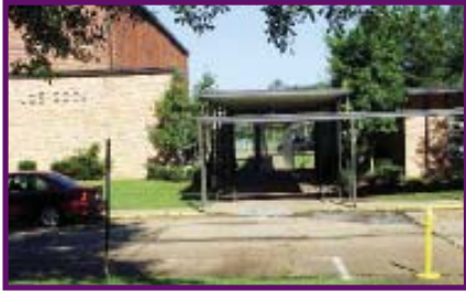
Cook Elementary 2217 North 7 th Street Columbus, MS 39705