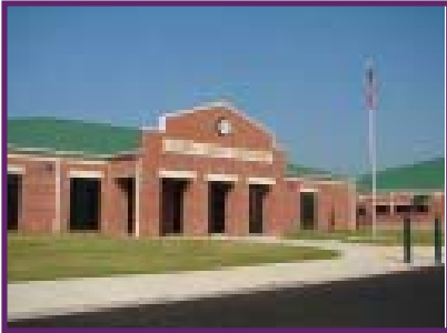
Stokes-Beard Elementary 311 Martin Luther King Drive Columbus, MS 39701

The Technology & Communication Magnet School at Stokes-Beard Elementary offers a strong academic program infused with technology and communication. This theme features state-of-the-art technology including digital classrooms, broadcasting studio, podcasting, dynamic learning, and Spanish language instruction beginning in Kindergarten. Research tell us the 21st Century Learner must have mastery of technology and communication skills to be successful.