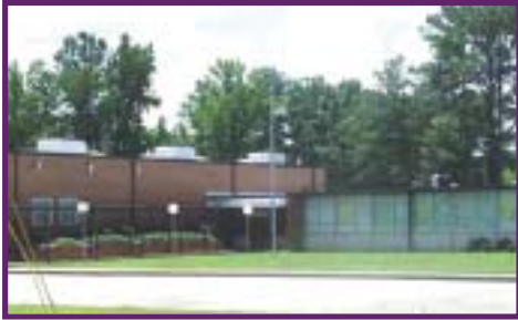
Sale Elementary 520 Warpath Road Columbus, MS 39702

The International Studies Magnet School at Sale Elementary offers a strong academic program infused with international and global studies to enhance the learning experiences of students. This theme features the International Baccalaureate Program (IB) which offers a comprehensive curriculum emphasizing higher-order thinking skills and problem-solving strategies for a world class education.